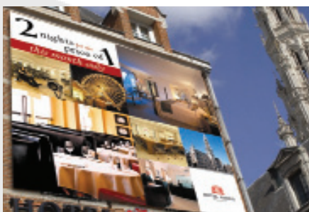
Weatherproof event banners Please call us on 01246 573888

These attractive and versatile 5mm black foamex signs are ideal for use in communal areas. They bear the traditional AA badge and establishments can choose their inscription.